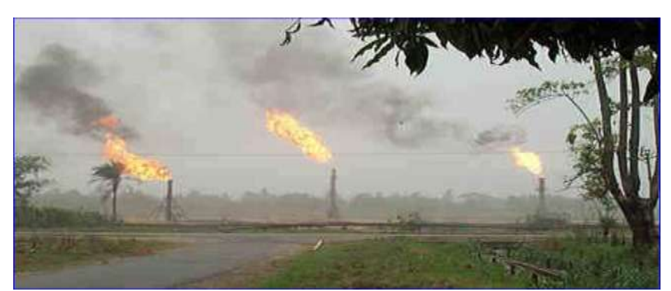
Fig. 4 Environmental Pollution Resulting from Agip Gas Flares at Ebocha, Niger Delta [34]